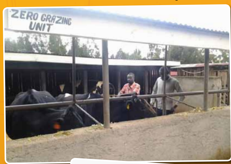
Julius and Solomon at the zero-grazing unit